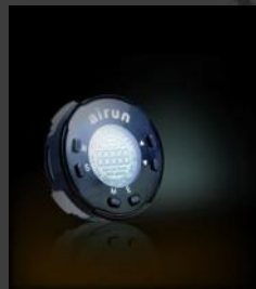
Smart Technology Controller